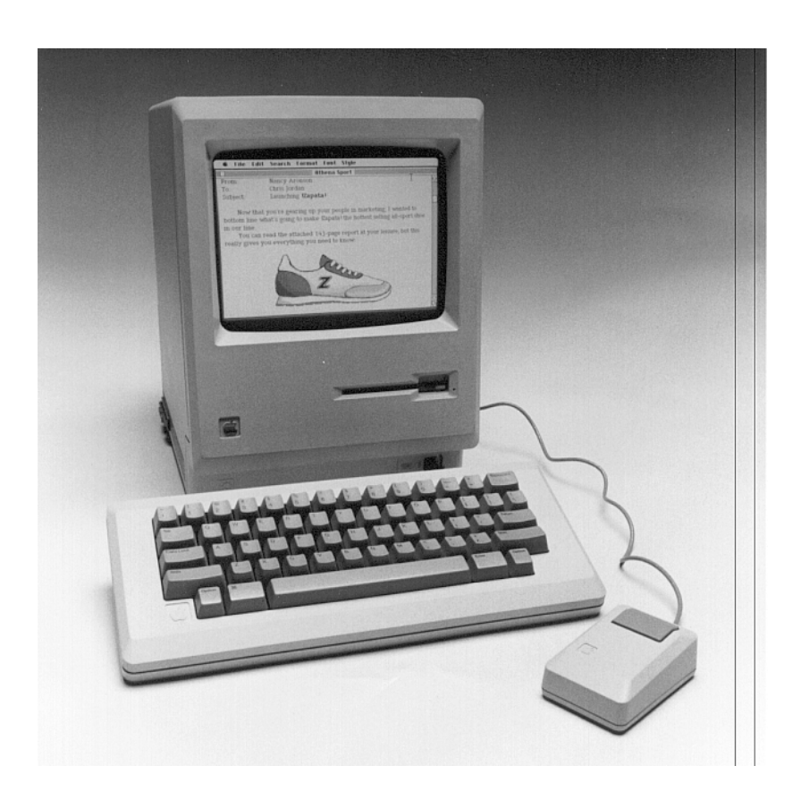
Figure 10.4: Macintosh computer.

The 64K of ROM contained; the operating system, a Finder program and a set of routines called the User-Interface Toolbox. The Toolbox routines controlled the mouse, windows, menus, text editing and other features of the user interface. A QuickDraw graphics program developed by Bill Atkinson was also in ROM. Two application programs were available from Apple. The first was MacPaint, also created by Atkinson and the second was the word processing program called MacWrite, written by Randy Wigginton. Microsoft had also adapted the spreadsheet program Multiplan and a Microsoft BASIC