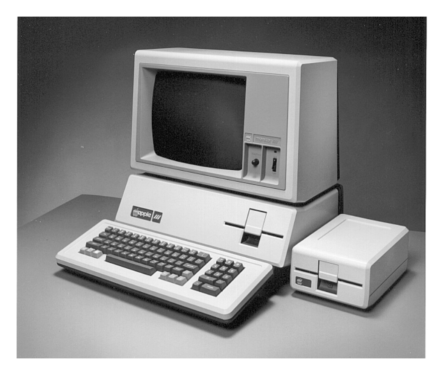
Figure 10.2: Apple III computer.

stopgap product to bridge between an anticipated fall-off in Apple II sales and the introduction of Lisa. The company targeted the Apple III at the small business owner and for professional-managerial users. Apple announced the computer at the National Computer Conference in Anaheim, California in May 1980 and started shipping them in the fall of 1980.